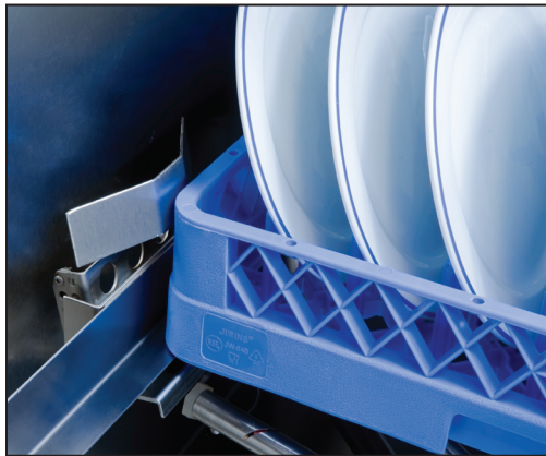
RackAware™ Automatic Rack Sensing System* only runs a cycle when a rack is present