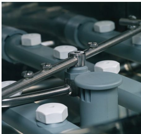
Superior cleaning action with 7 bayonet style wash arms with 42 fixed wash jets.