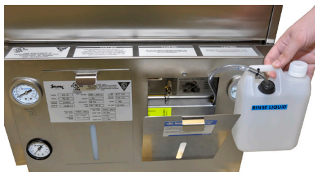
Chemical levels are always viewable and chemical replacement easily accessible with front mounted containers.