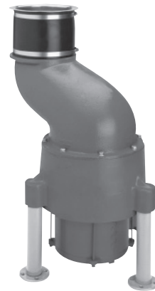
O Style Optional off-set body for use with bowl/cone trough